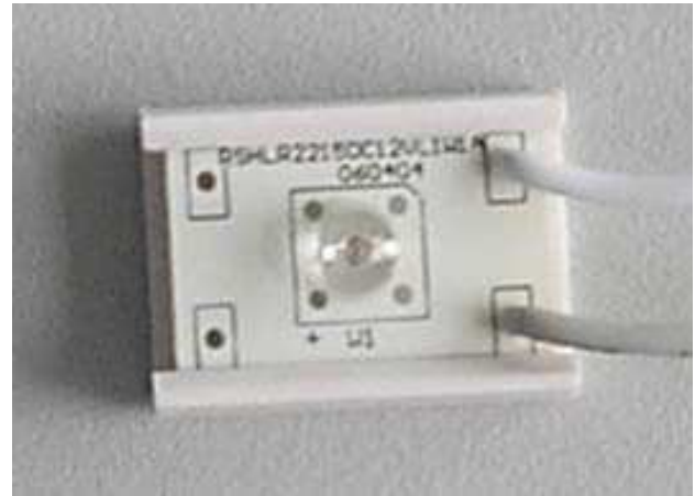
X may be W, R, R, G or B